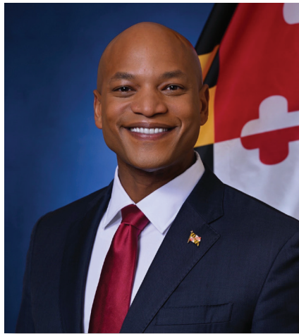
Wes Moore Governor